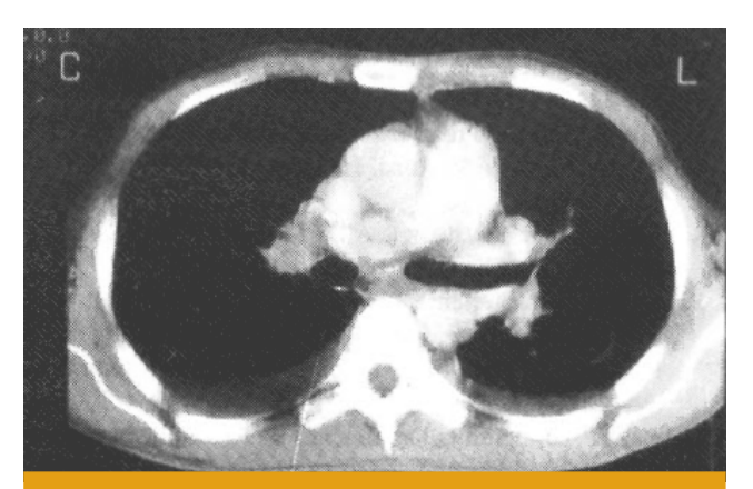
Pulmonary Kaposi's Sarcoma. Thoracic CT scan: subcarina adenopathies and bilateral hilar with pleural effusion of bilateral moderate volume, bulkier on the right.