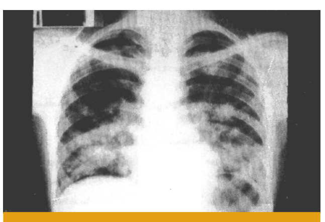
Pulmonary Kaposi's Sarcoma. Thorax radiogram: perihilar linear opacities associated to bilateral poorly defined parenchymal nodules.