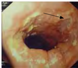
Active duodenal ulcer (arrow).

The excessive administration of alkalinizing agents may be accompanied by metabolic alkalosis, particularly where renal elimination